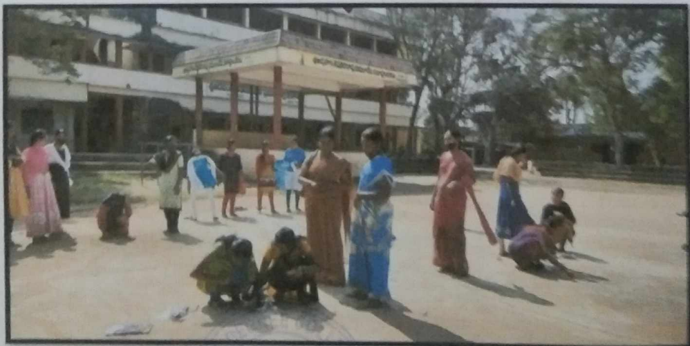
Judges on the way