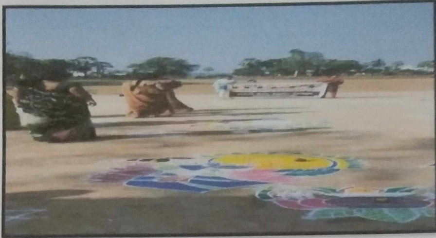
Sky is the limit