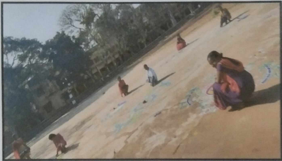
Students creating colours on earth

The Women Empowerment Cell extends heartfelt gratitude to all participants for their enthusiastic participation and remarkable contributions to the success of the Rangoli Competition. Special thanks are also extended to the faculty members for their support and guidance in organizing the event, thereby creating a memorable and enriching experience for all involved.