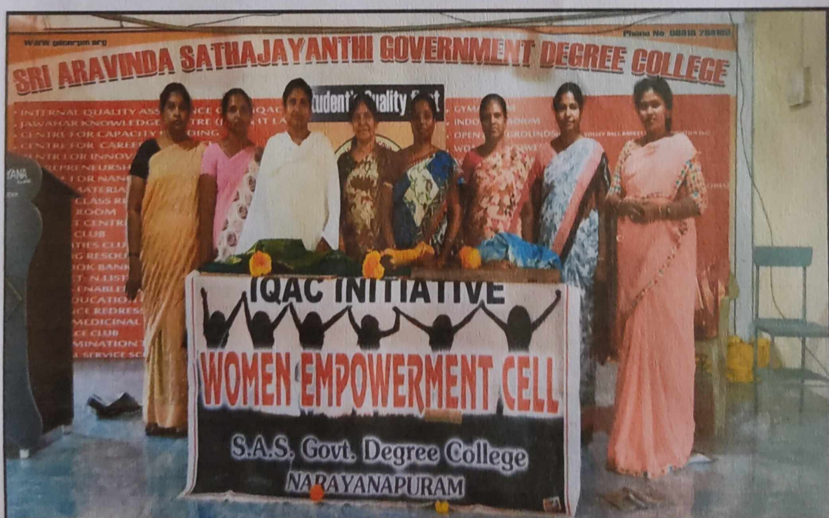
All women faculty on the stage

In conclusion, the Women's Day celebration organized by the Women Empowerment Cell was a resounding success, embodying the spirit of empowerment, inclusivity, and solidarity. The event reaffirmed our commitment to championing the cause of gender equality and creating a more just and equitable society for all.